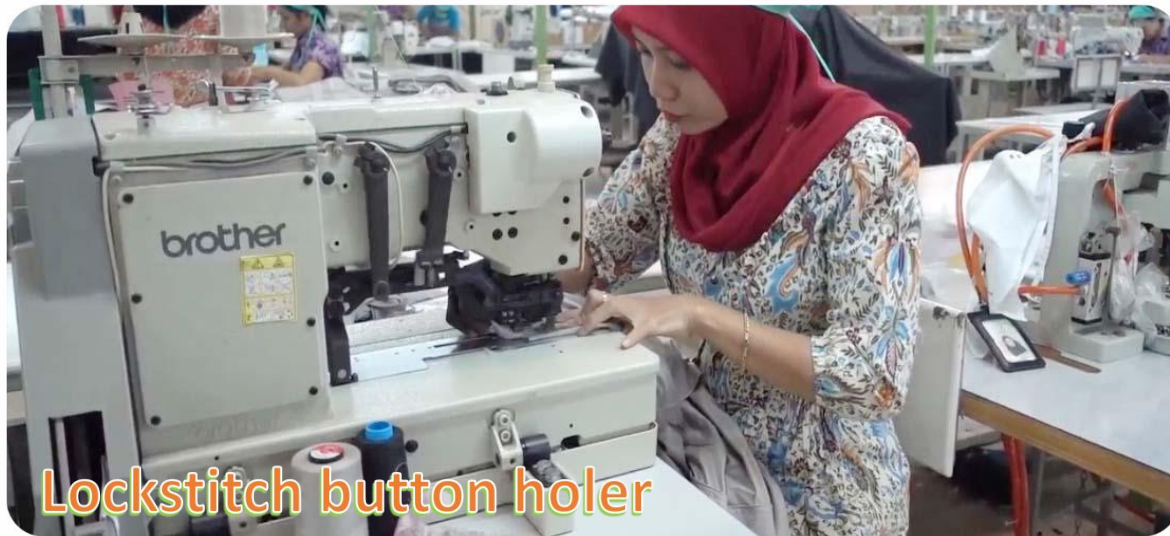
Lockstitch button holer