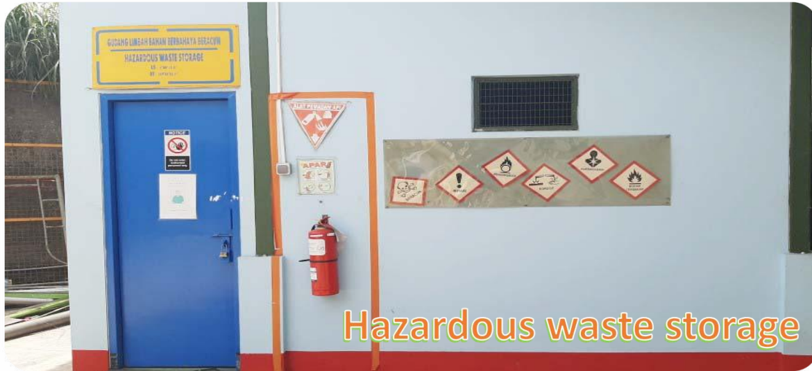
Hazardous waste storage