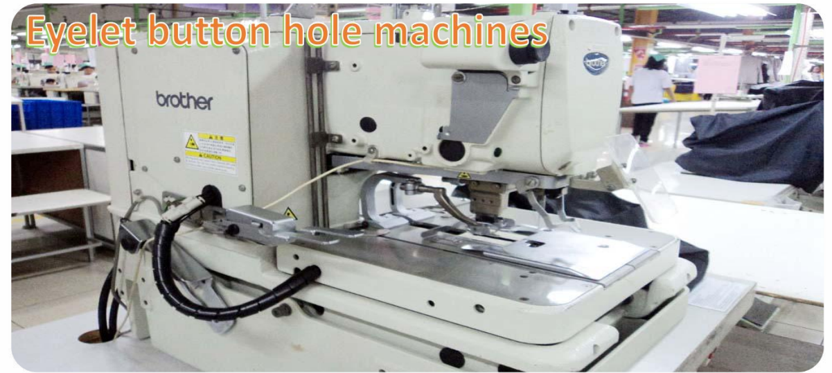
Eyelet button hole machines