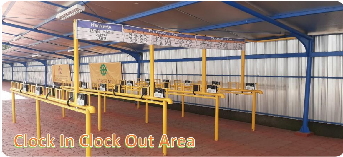
Clock In Clock Out Area