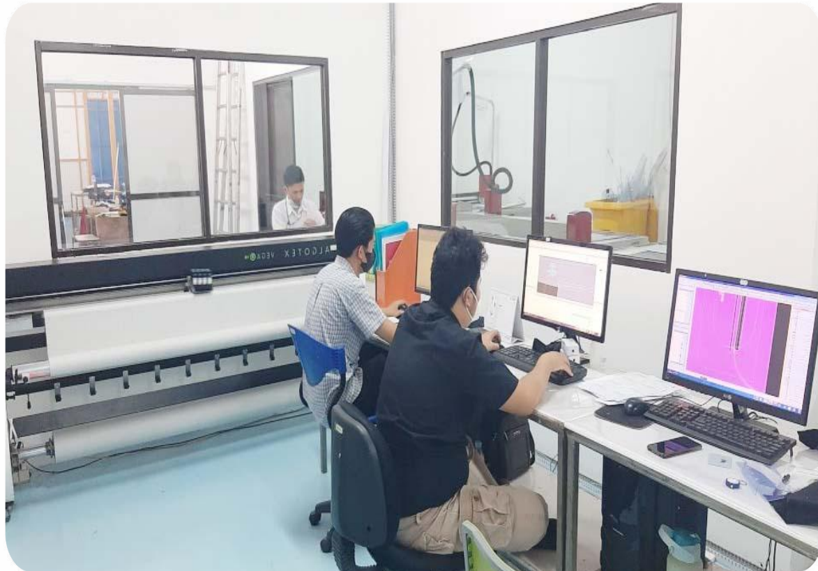
Template pattern drill machine