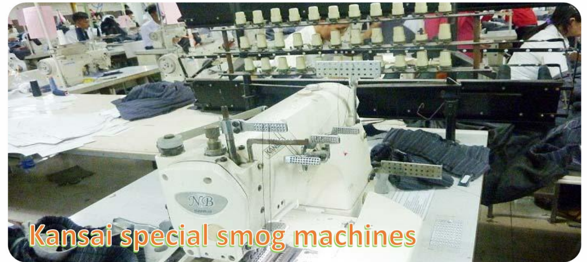
Kansai special smog machines