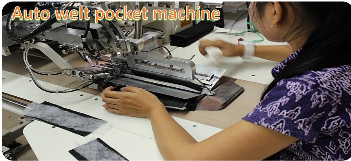
Auto welt pocket machine